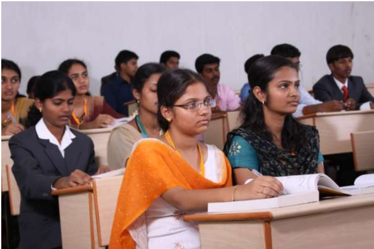
Classroom/Tutorial Room facilities