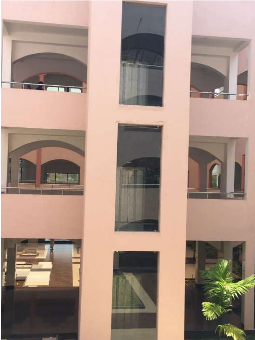
Any other facilities